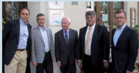
LMHI Executive Committee