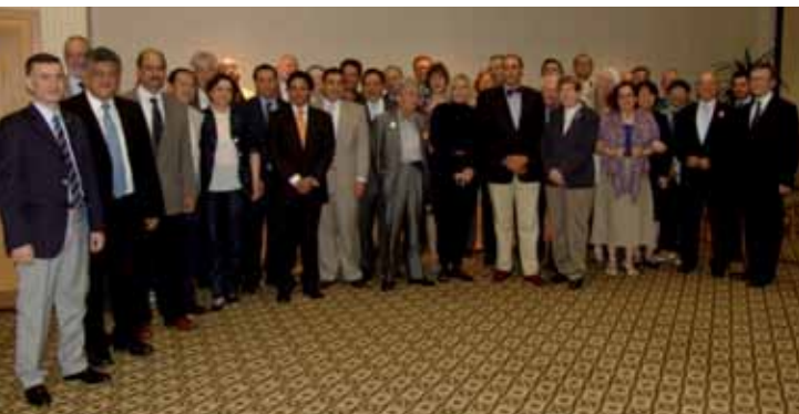
LMHI International Council